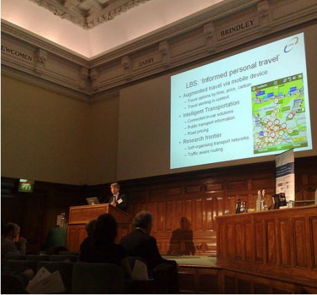
GIS Presentation @ Next Generation Web